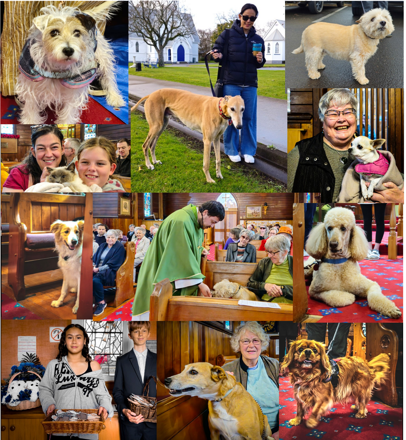
from the Pet Service