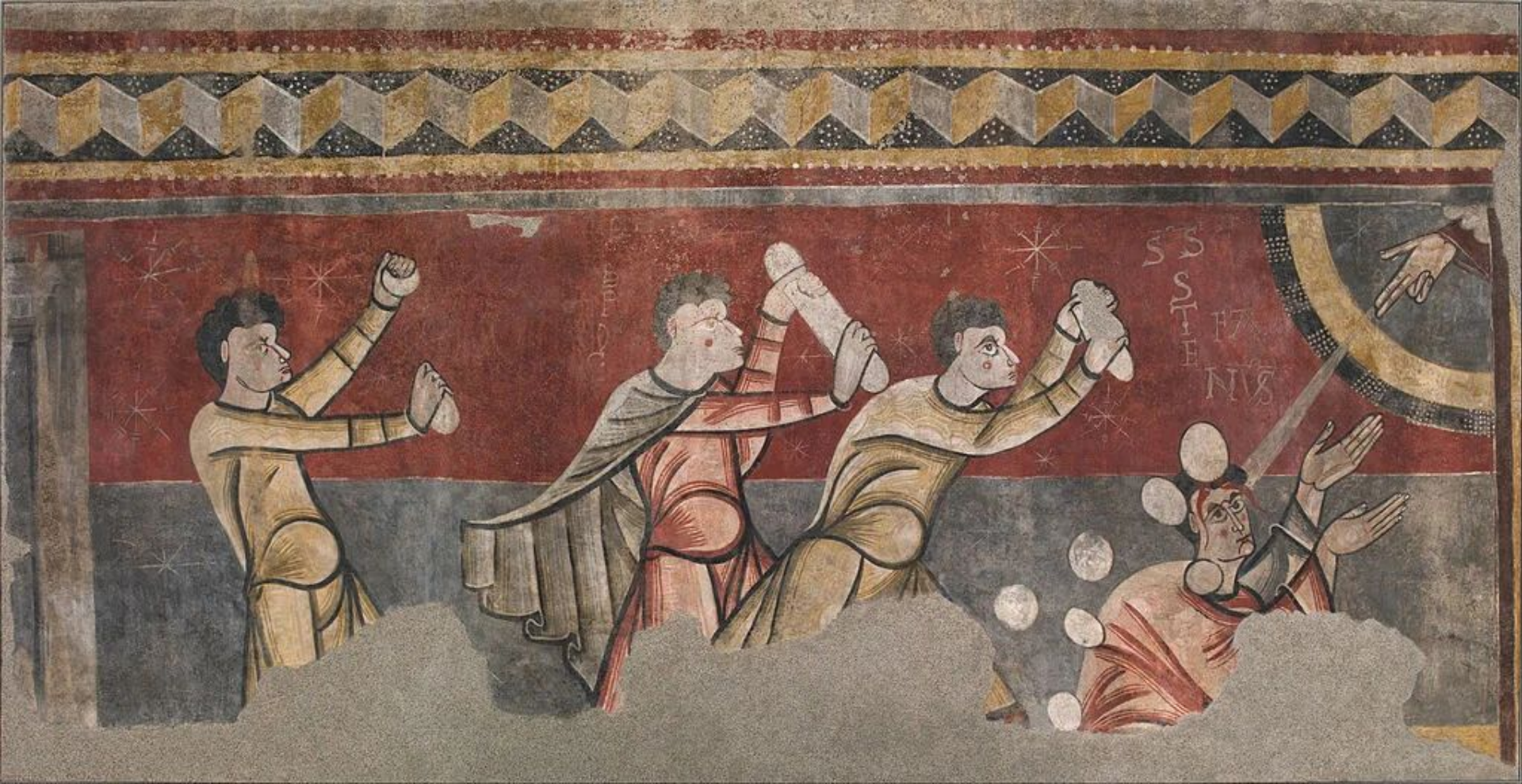
The "Stoning of Saint Stephen" is an 11th-century Romanesque mural from the church of Sant Joan de Boí in the Vall de Boí, Catalonia, Spain.